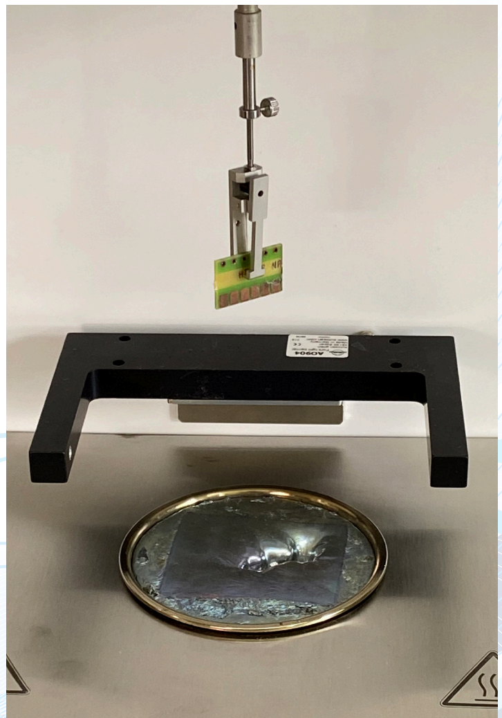
Test area with light curtain and easy to use tool holder